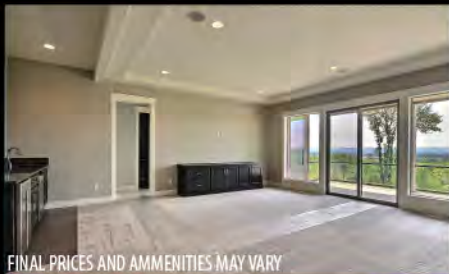
FINAL PRICES AND AMMENITIES MAY VARY