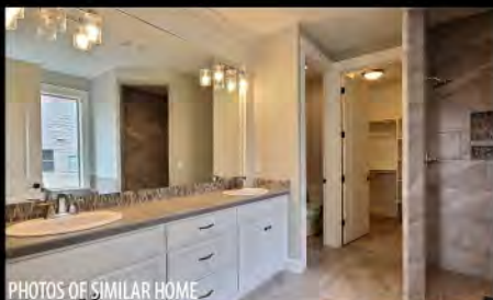
PHOTOS OF SIMILAR HOME