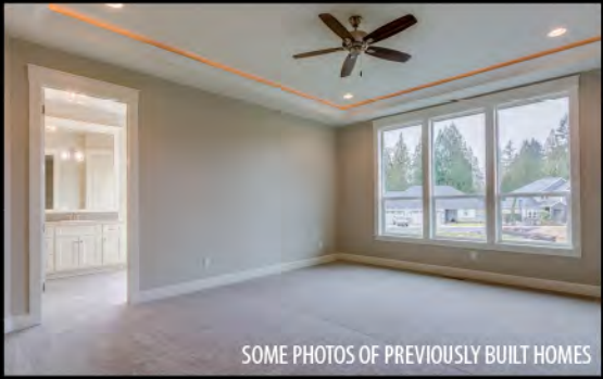
SOME PHOTOS OF PREVIOUSLY BUILT HOMES