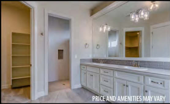
PRICE AND AMENITIES MAY VARY