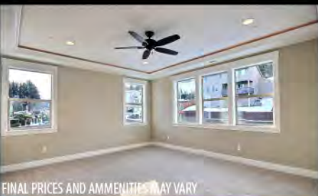
FINAL PRICES AND AMMENITIES MAY VARY